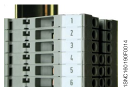
Vertical terminal block assembly